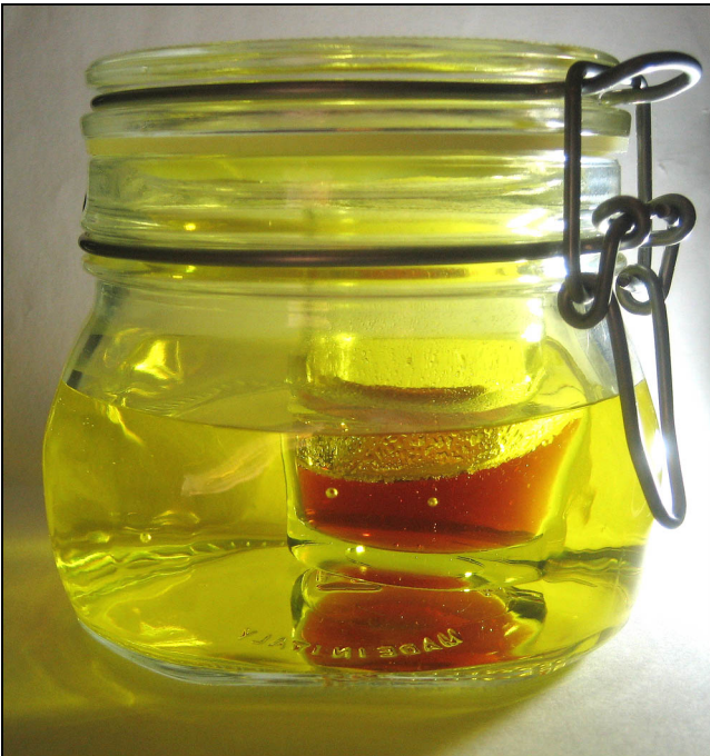
17oct'21 500ml container with 250ml water. "shot glass" with 5g SCF+5.5ml water plus 5g CAC+4.5ml water. Photo at +30 minutes.

At +3 hours 3665 ppm, 3.5 pH, 97 TDS, 39% efficiency conversion of sodium chlorite to chlorine dioxide. Everything and activation at room temperature. The receiver did leak out some CLO2 gas.