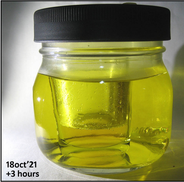
18oct'21 +3 hours