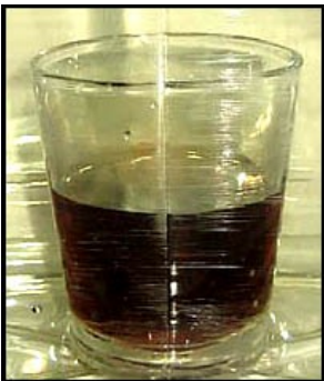
Typical reactor solution depth and color in 2012

Another important reason to use dry ingredients is that there is no question about their concentrations. We are not using them to make any specific concentrations; only using specified weights as per the recipe. The small amount of added warm water to each reactor ingredient is just enough to completely dissolve them into the water. That allows for very fast activation, which releases chlorine dioxide gas from the sodium chlorite solution. That chlorine dioxide gas then dissolves into the 250ml of CDS water. --CL